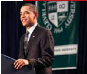
Barack Obama President of the United States February, 2011

“ [we came to Northeast Ohio] because of what’s been done by JumpStart... your region has been thinking creatively. ”