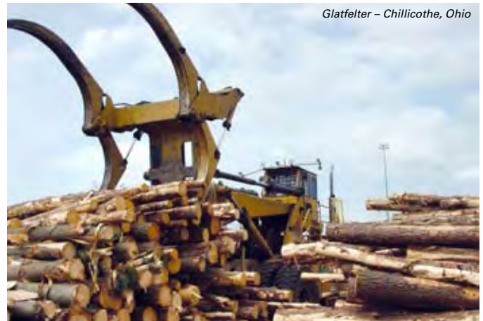
Glatfelter – Chillicothe, Ohio

Not long ago, a paper mill with more than a century-long history in Chillicothe was acquired by Glatfelter , one of the world’s leading manufacturers of specialty papers and engineered products. During the transition, the company routinely hired interns and in 2008 sponsored 19 Ohio Third Frontier interns from a variety of engineering disciplines including Chemical, Pulp and Paper Engineering. Ten of these interns matriculated into full-time employees of Glatfelter .