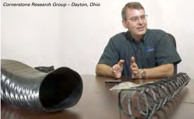
Cornerstone Research Group – Dayton, Ohio

The Ohio Third Frontier Internship Program is helping develop a pool of talented workers for Ohio’s businesses, creating enriching student work experiences in STEM (Science, Technology, Engineering, and Math) disciplines, and assisting those students in